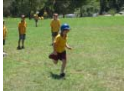
Going for first (Port Macquarie)