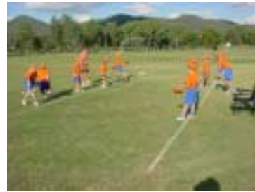
St Edwards (NSW) warming up

known once they begin their domestic competitions. Taree and Armidale have shown interest in the program for year two.